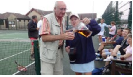
It's not all about tennis its about having fun as well

For full details of how to join please contact Ashover Tennis Club via email: ashovertennis@btinternet.co.uk Further details about the club can be found on the Ashover Tennis Club website: www.ashovertennisclub.btck.co.uk